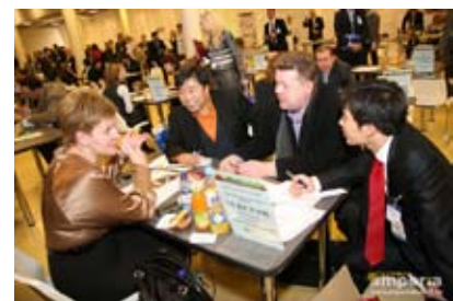
Negotiations on the supply with X5 Retail Group