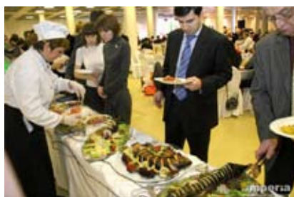
Finnish cuisine Zone