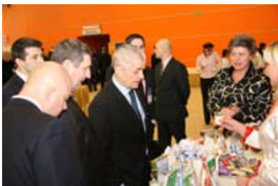
G. Onishchenko, Head of Rospotrebnadzor of Russia