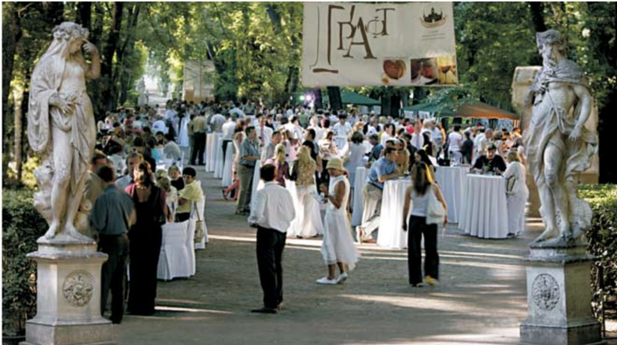
Annual promenade-concert "Art-Music-Wine"

unforgettable festival for judges of good music, delicate drinks and pleasant atmosphere of warm June evening in Letniy Sad.