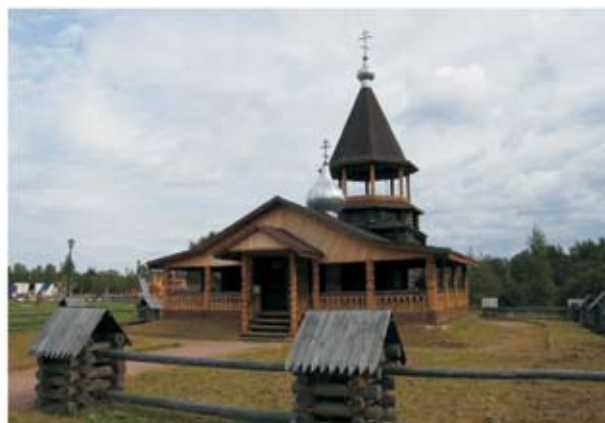
Chapel of the Nativity of the Most Holy Mother of God