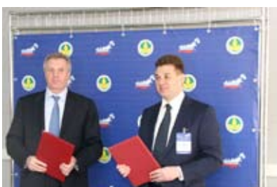
Signing of agreement between SOYUZMOLOKO and Rosagroleasing