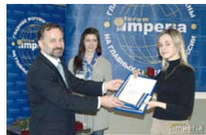
Winners of the contest get awards