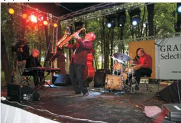
I. Butman, world famous jazzman