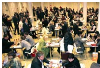
Chains' Wholesale Center™