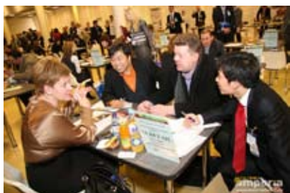
Negotiations on the supply with X5 Retail Group