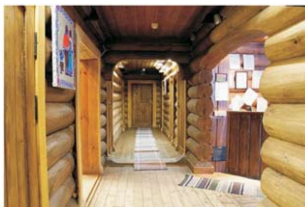
Interior of the hotel “Koshel”