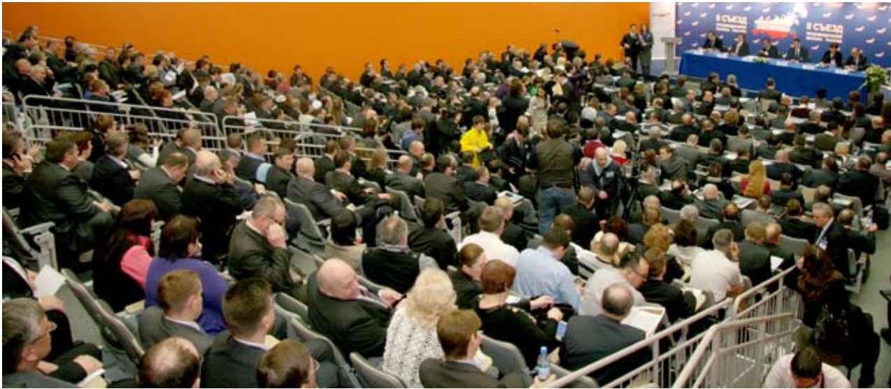
All-Russian Meeting of milk products industry

All-Russian meeting of dairy industry (Moscow, VVC) was held on March, 14th 2011, where SOYUZMOLOKO showed concrete results of constructive engagement of industry associations, market participants and authorities. The congress