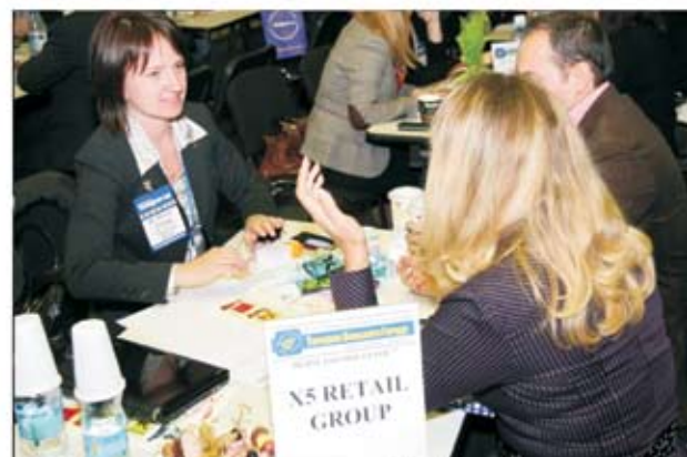
Negotiations on the supply with X5 Retail Group