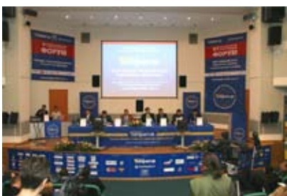
Presidium of the Forum