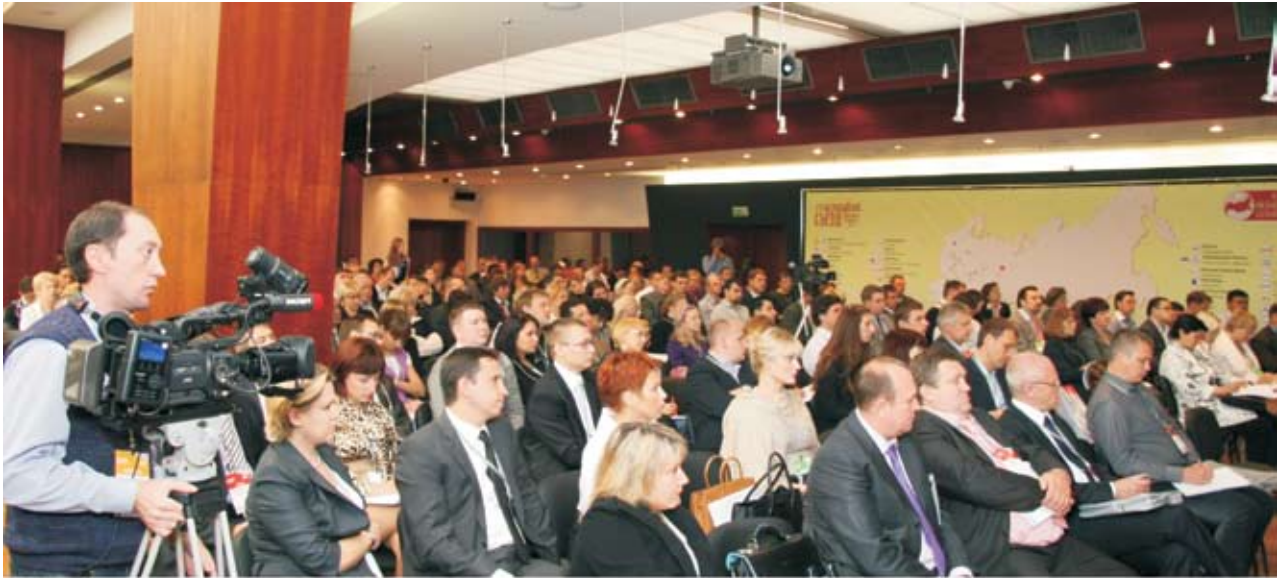
All-Russian Meeting of Independent Chains-2010

company "Imperia" Chains Wholesale Center™ of Independent Chains Union was organized for the first time.