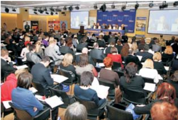
All-Russian Trade Forum on Prodexpo Fair