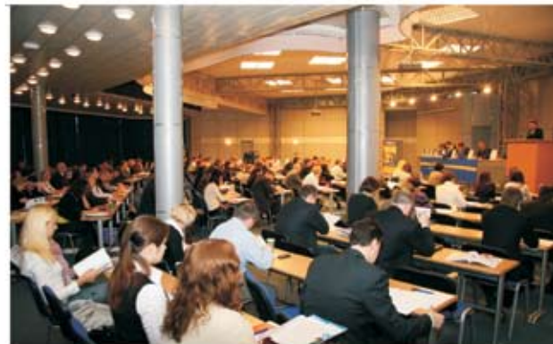
Food Forum "Trade in the Big City"