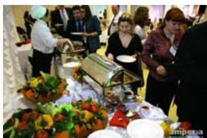
Italian cuisine Zone