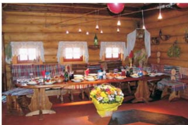
Museum of Russian Vodka