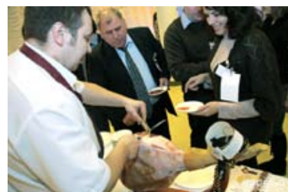
Spanish cuisine Zone