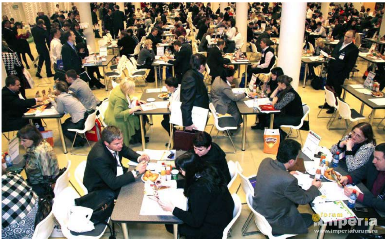
265 buyers from 116 retail chains in Chains' Wholesale Center at Prodexpo-2011

Within the bounds of Wholesale Center™ at Prodexpo-2011 400 manufacturers and distributors held individual conversations by prerecording with 265 purchasing agents from 116 retail chains. The following purchasing agents worked in Procurement Center: X5 Retail Group (chains "Pyaterochka", "Carousel", "Perekrestok"); Auchan; Dixy; Lenta; O'Key; Spar; Billa; RegionMart; Federal Procurement Union "System "T3C"; Maria-Ra and others.