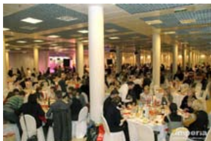
Gourmet-Banquet for Directors at Prodexpo-2011

treat purchasing agents with their production, made and served at the highest level: each gourmet-dish was presented by supplier under its own brand. The famous special dishes from 20 countries were served at Gourmet-Banquet, among them there are the following: Spanish hamon, American steaks made of marble veal, Swiss fondue, French ratatouille, Korean mantu, Indian samosa, Uzbek shurpa and tens of other famous national delicacies. Show-ballet “Expressia” and Sergey Gribkov’s bar-show complemented the evening, during bar-show everyone could enjoy a cocktail made according to individual recipe.