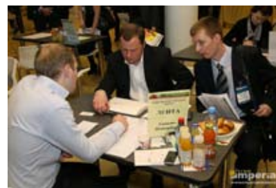
Negotiations on the supply with chain Lenta