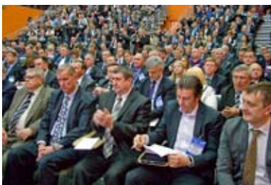
Front row: M. Blonde, Minister of Agriculture and Foodstuffs of Belarus