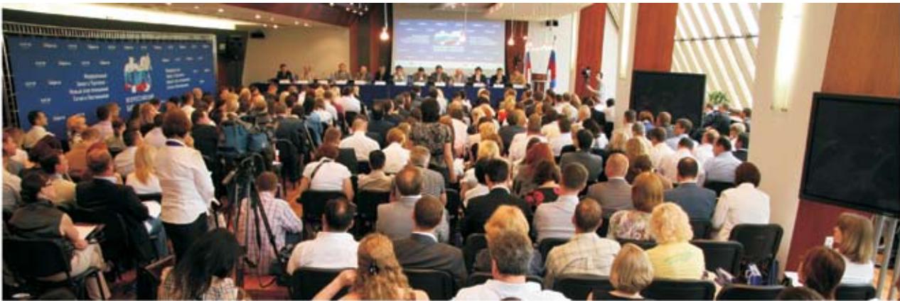
All-Russian Business-Forum “Federal Trade Law”

In view of a new Trade Law adoption, All-Russian Business-Forum “Federal Trade Law - New stage of Chains and Suppliers relations” was held in June, 2010. This event became regular, it com-