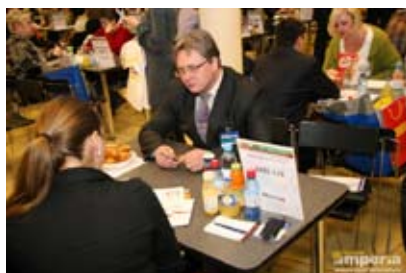
Negotiations on the supply with chain Auchan