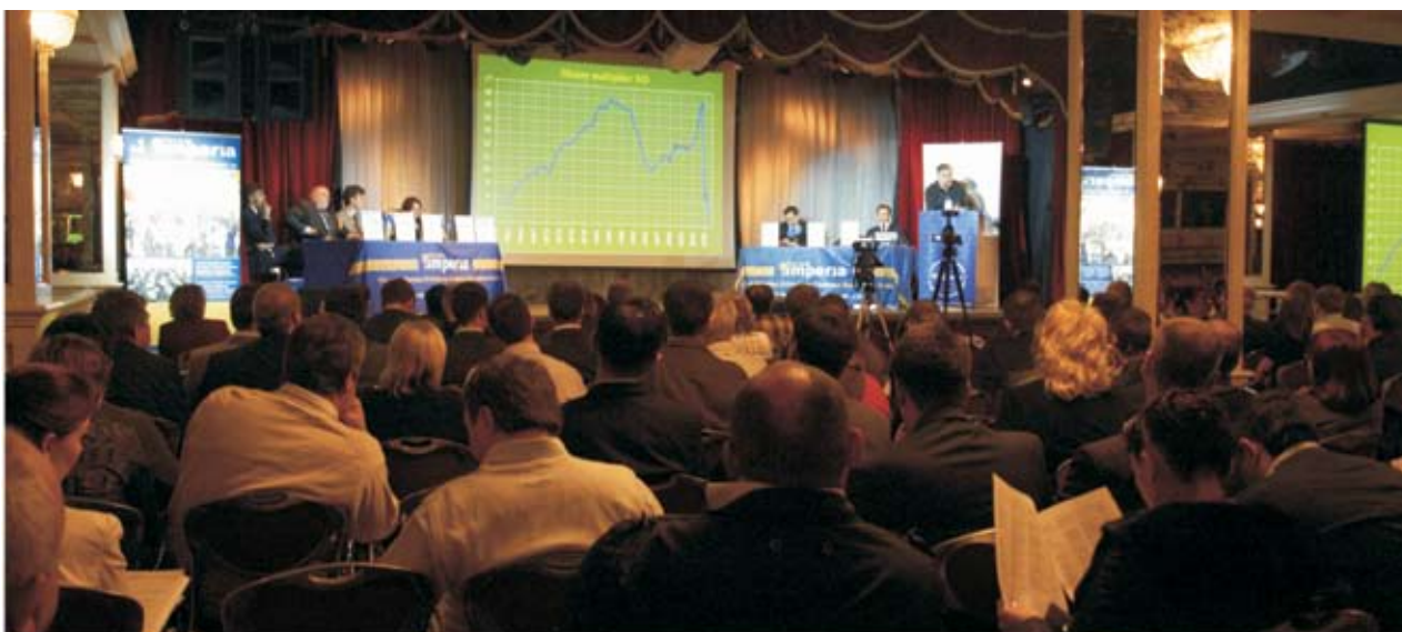
IV All-Russian Anti-crisis Forum

the context of financial crisis, and also analytics, projections, researches of FMCG market are discussed within the Forum program.