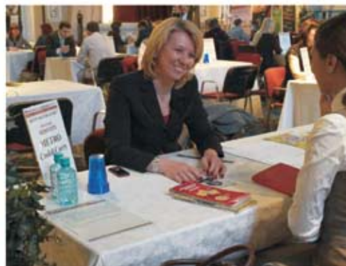
Negotiations on the supply with chain Metro C&C