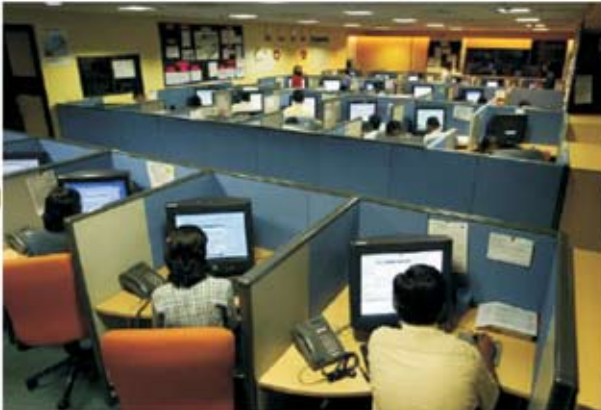
Automated call centre