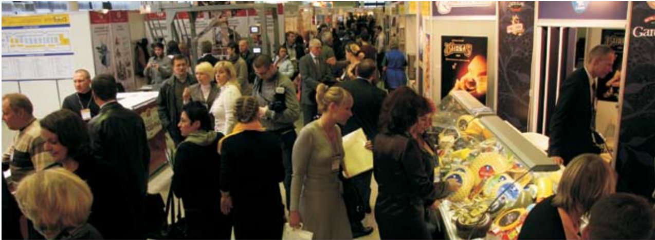
International Food Fair "Peterfood"

"Peterfood" is the sole fair in country which guarantees to exhibitors a contact with purchasing agents from retail chains right on the booths.