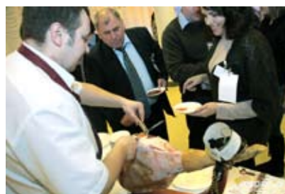
Spanish cuisine Zone on the Gourmet-Banquet