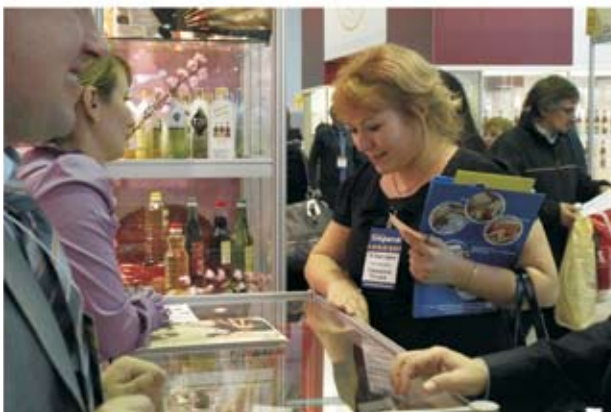
Negotiations on the supply with chain GK "Viktoria"