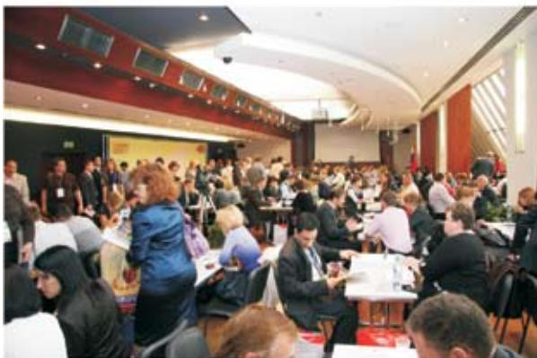
Chains Wholesale Center™