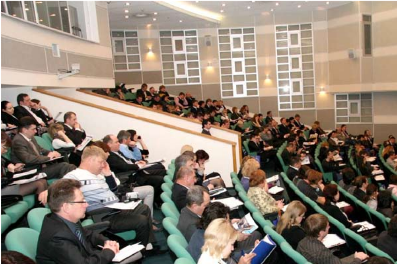
VI All-Russian Trade Forum

ment Center™; Private Label Exchange; contests “Chains choice” and “Innovation product”; All-Russian Gourmet-Banquet for Directors.