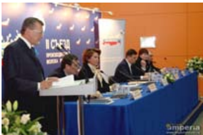
V. Zubkov, First Deputy Prime Minister of Russia