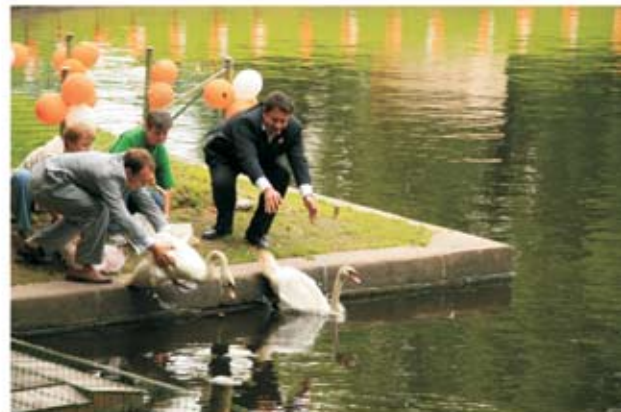
Ceremony "Swans at present to Letniy Sad"