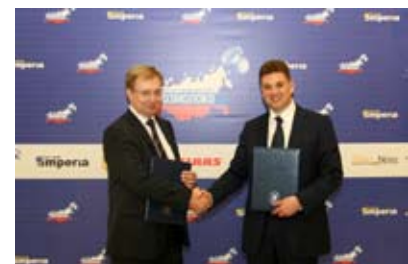
Signing of agreement between SOYUZMOLOKO and MICEX