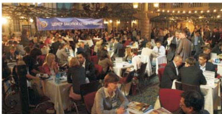
Chains Wholesale Center™