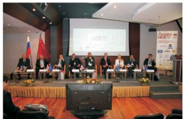
Presidium of the meeting